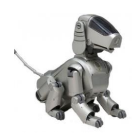
Fig. 1. When Sony's AIBO was first released in 1999, it included a 64-bit processor, 16MB of RAM, and an array of sensors for creating the robot's personality.

Tamagotchi (BanDai),<sup>3</sup> and toys like the Sony AIBO, the popular robotic dog first introduced almost 20 years ago.<sup>4</sup> See Fig. 1.