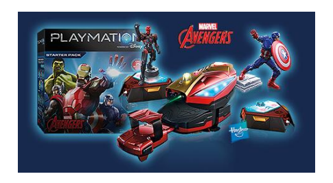
Fig. 4. Playmation (Disney) is an example of a connected Toys to Life toy.

Toys to Life are a genre of connected toys that involve physical figures or characters that become a child's interactive companions, often by interacting with video games. The toy is often an action figure or a doll with a pre-determined personality, such as Mattel's Hello Barbie. Although it may be interactive on its own, some Toys to Life also become digital characters, such as Edwin the Duck, a physical rubber duck that also becomes a digital, animated companion in its accompanying app.