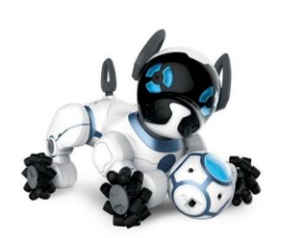
Fig. 5. CHiP (WowWee) is an example of a robotic toy.

Some robot toys may only be controllable through an app. Other robots are fully interactive without the use of an