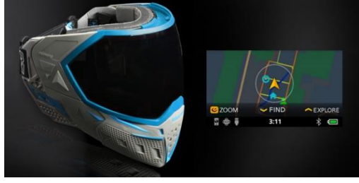
Recon Instruments, Inc.

Description : Empire EVS is a goggled-helmet used for playing paintball with a special display that uses GPS to show the current location of the player and team members in real-time. It pairs with a smartphone via Bluetooth or can directly connect to Wi-Fi and GPS. It can also connect to other paintball equipment to measure data such as shot count, rate of fire, and battery level.