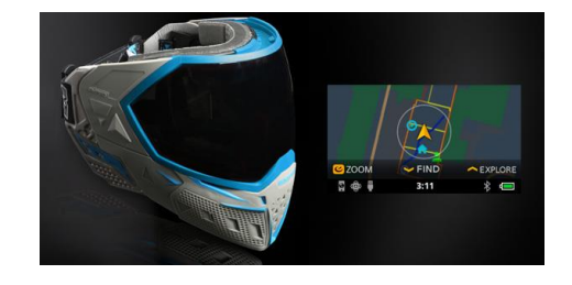
Fig. 6. EMPIRE EVS (Recon Instruments and Empire Paintball) is an example of a connected wearable tov.

Wearables are connected toys that are primarily worn as accessories, such as bracelets, armbands, or helmets that are equipped with sensors. Increasingly popular with children, wearables may collect a range of sensory and bodily data—e.g. precise location, acceleration, motion, heart rate, and activity levels.