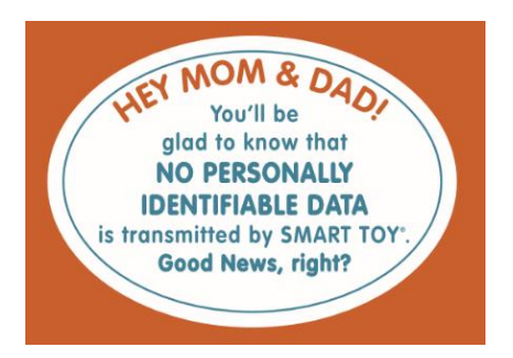
Fig. 10. Packaging label notice on Fischer-Price's connected toy, Smart Toy.

A full privacy policy on the box is not likely to be helpful, but some sort of cue will help parents decide before purchasing whether they are comfortable with the toy or whether they would like to do more research. For example, a toy's packaging could say: "Parents, this toy will require that you create a personal online account in order to access all features" or "Parents, this toy will require your permission to use your child's information to bring the toy to life!". This is in line with other well-recognized disclosures on packaging ("Batteries not included" or "sold separately"). See, e.g., Figure 10.